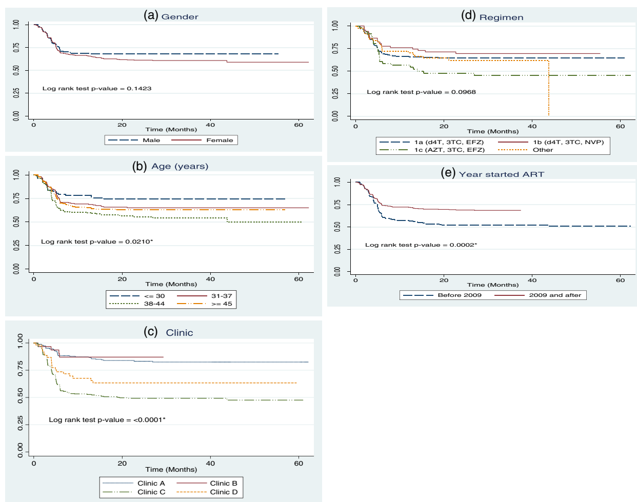
Figure 2 Kaplan Meier curves for time to first ADRs among HIV patients on ART, South Africa 2007–2012 classified by (a) gender, (b) age, (c) clinic (d) regimen and (e) Year started ART. HIV.

Timing of first ADR was also analysed using logistic regression where the outcome was categorized as 1 if a patient had an ADR and 0 otherwise. The substantive results were the same as those obtained using survival models. Using logistic regressions models this way does not account for possible correlation between recurrent ADRs. Additionally, exposure time is not taken into account in the logistics regression models, in contrast to time-to-event models described in the preceding sections.